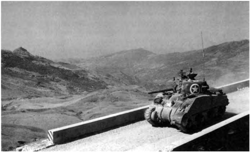
A Sherman tank moves past Sicily's rugged terrain.

Alexander's 15th Army Group directed the U.S. Seventh Army, under the command of Lt. Gen. George S. Patton, Jr., and General Sir Bernard Montgomery's British Eighth Army.