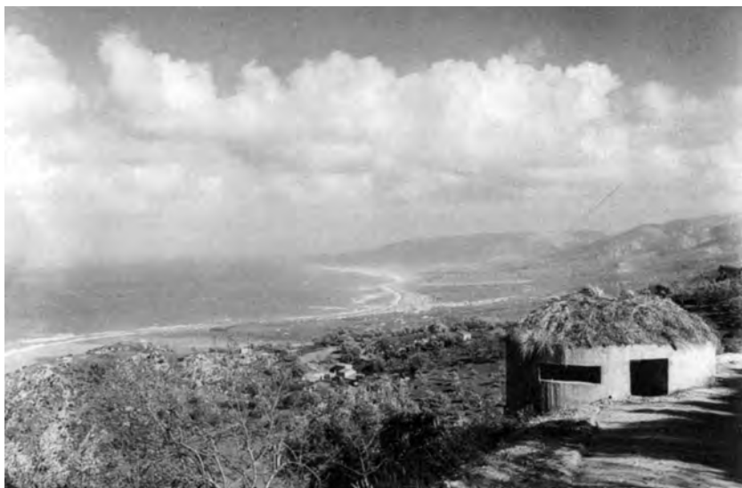
A bunker covers the beach near Sant'Agata.