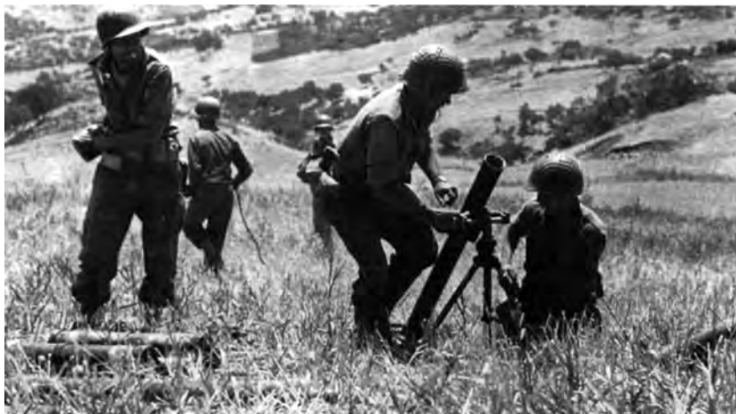
81-mm. mortars support Patton's drive on Palermo.

been implicit in the campaign plan all along. On the other hand, by ordering the Seventh Army to stop short of Highway 124 and redirecting its advance, Alexander lost momentum and provided the Axis valuable time to withdraw to a new defensive line between Catania and Enna. The loss of momentum was best illustrated by the repositioning of the 45th Division, which had to return almost to the shoreline before it could sidestep around the 1st Division and take up its new position for a northwestward advance. Given the circumstances, Alexander might have been better served by reinforcing success and shifting the main emphasis of the campaign to the Seventh Army. This was not his choice, however, and his decision stirred up a storm of controversy in the American camp.