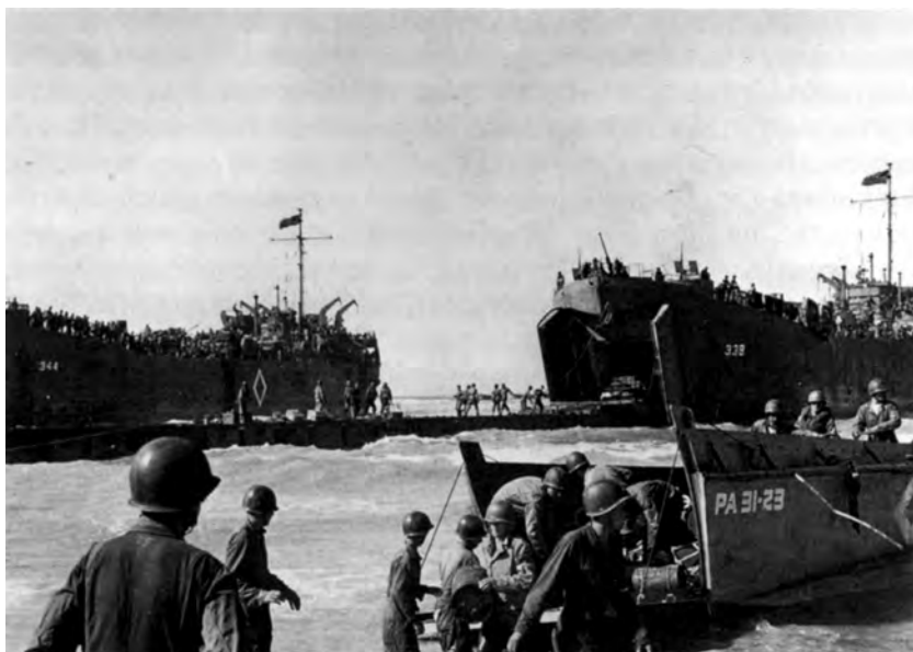
Troops and supplies unloading near Gela on D-day.

convoys moving toward Sicily earlier that day, and Guzzoni had ordered a full alert at 2200 on the 9th. Based upon the reported airborne drops, Guzzoni correctly surmised that the Allies intended to come ashore in the southeast, and he issued orders to that effect at 0145 on 10 July, nearly an hour before the first assault wave hit the beach. Nevertheless, the dispirited and ill-equipped Italian coastal units hardly put up a fight. Opposition in the Eighth Army's sector was negligible. By the end of the first day the British were firmly ashore and well on their way toward Augusta, having walked into Syracuse virtually unopposed. Resistance was not much stronger in the American zone, and the Seventh Army had little trouble moving ashore despite sporadic air and artillery attacks.